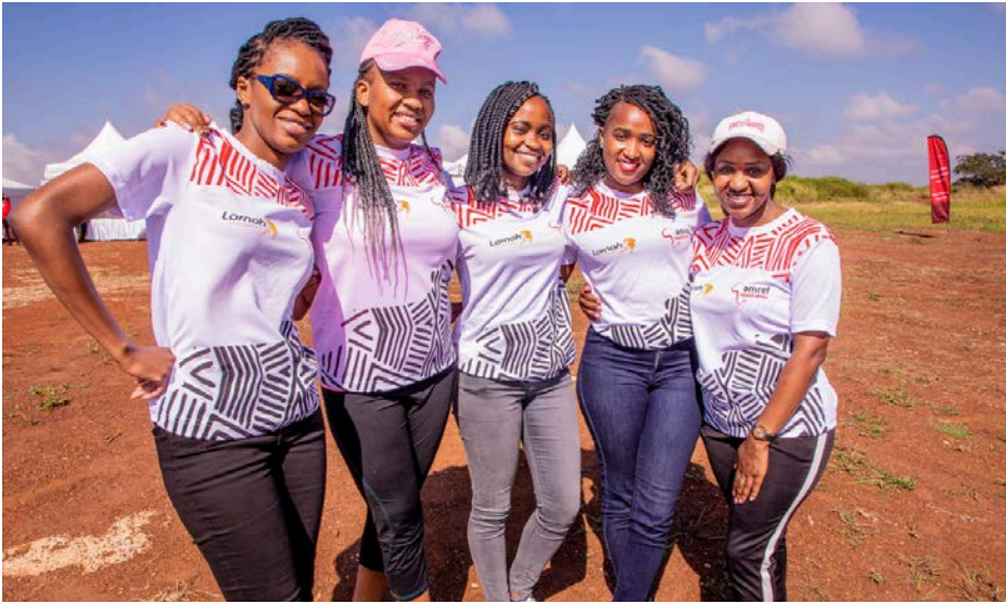
Participants at Amref's Wellness Festival in Feb 2020 in Tatu City, Kenya. (Same as previous page)