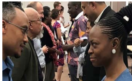
Strategic Planning Workshop, 2018

Our primary advice is to start. If we had waited until we had assessed every nuance of our recruitment, hiring, management, salary-setting, promotion, leave and other policies so that we could unveil a comprehensive overhaul, we would not have made any changes yet!